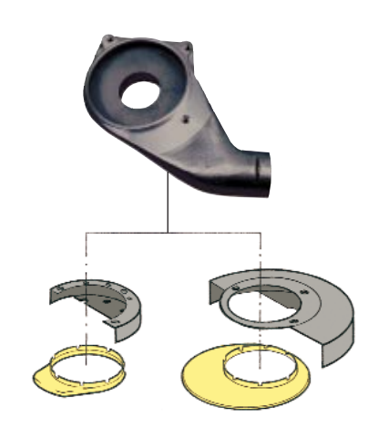
The wheel guard and the snap-in hood are available for Ø125 mm (5") and Ø180 mm (7") grinding wheels.

This kit consists of three main parts, an aluminium manifold, a wheel guard and a snap-in plastic hood. There are a large number of manifolds machined to fit different tool makes and models.