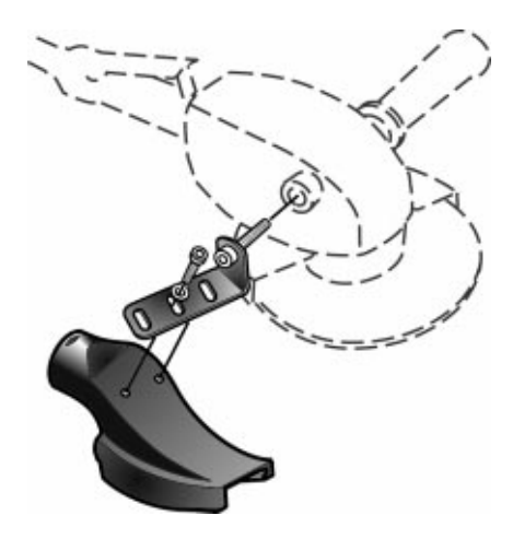
The adapter can hold the nozzle in two positions to match Ø180mm (7") or Ø230 mm (9") grinding wheels.

This kit consists of two main parts, an extraction nozzle and a tool adapter. The unique design allows the nozzle to efficiently remove the dust without interfearing with the work.