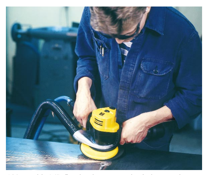
180 mm kit (7") fitted to heavy metal grinder. Turning the snap-in hood compensates for a decreasing grinding disc diameter.