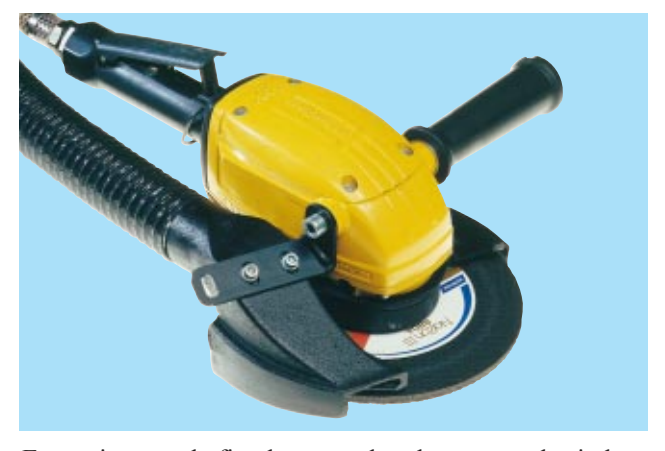
Extraction nozzle fitted to a modern heavy metal grinder.