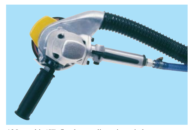
125 mm kit (5") fitted to medium size grinder.