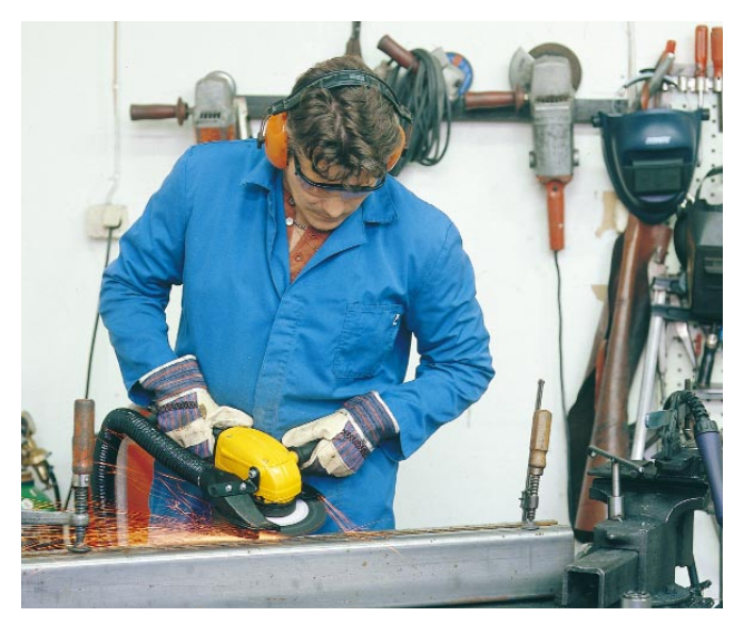
Tool in operation. Fine particles are efficiently captured. No "smell of grinding" any more. Heavy particles, not hazardous to your health, are hard to capture.

This kit consists of three main parts, an aluminium manifold, a wheel guard and a snap-in plastic hood. There are a large number of manifolds machined to fit different tool makes and models.